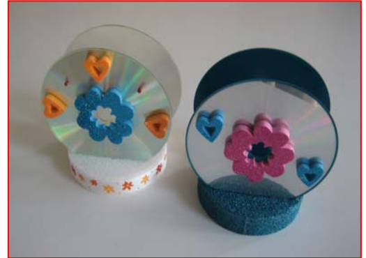
A great gift for Mothers Day or Fathers Day.